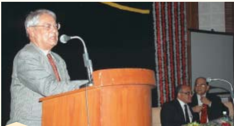
Professor Andre Beteille delivering the Professor V K R V Rao Memorial Lecture on 'The Present Significance of Caste' at ISEC on the Founder's Day.

The fifth Professor V K R V Rao Memorial Lecture on the topic 'The Present Significance of Caste' was delivered by Professor Andre Beteille, Chairman, Indian Council of Social Science Research, New Delhi.