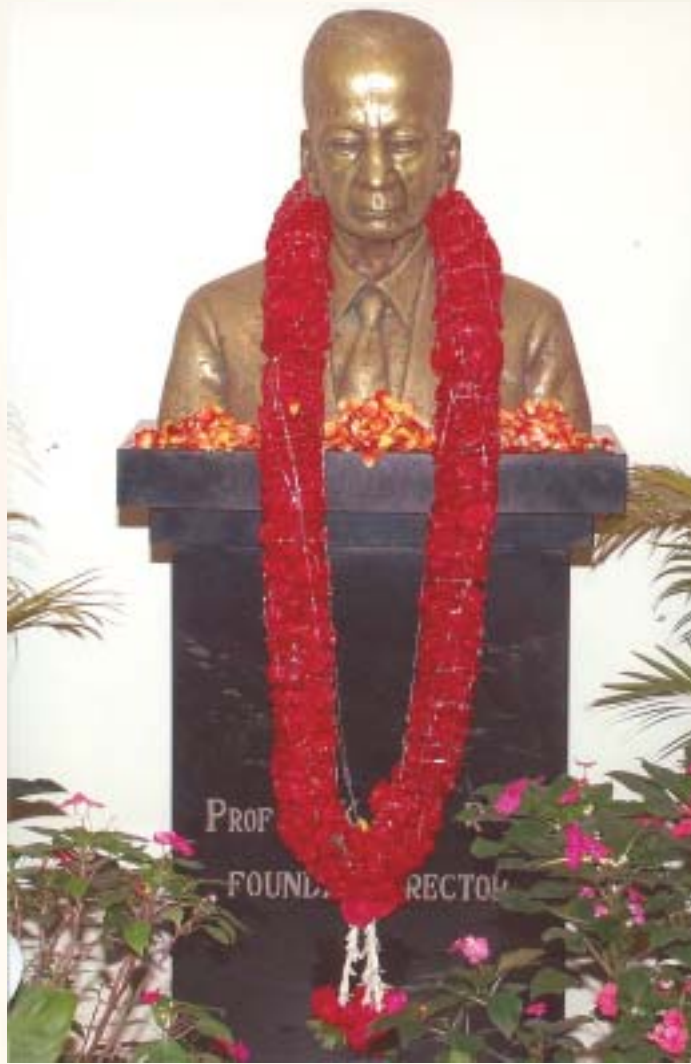
ISEC is celebrating the Birth Centenary of its founder the Late Professor VKRV Rao this year (July 8, 2007 – July 8, 2008).