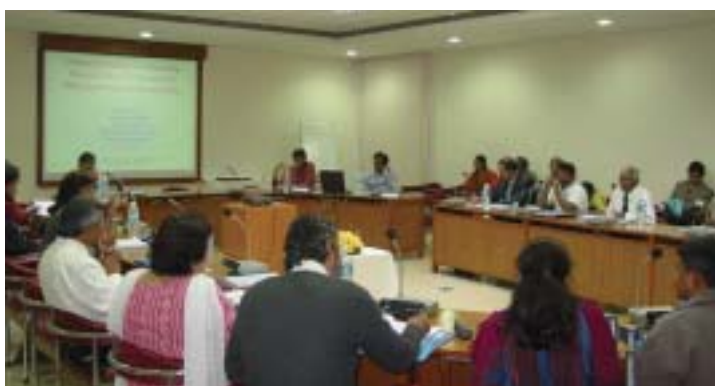
The workshop in progress

The Centre for Interdisciplinary Studies in Environment and Development (CISED), a Centre of Excellence promoted by the ISEC, organised a two-day workshop on Understanding Community-Based Natural Resource Management (CBNRM) in South Asia on December 13 th and 14 th , 2005.